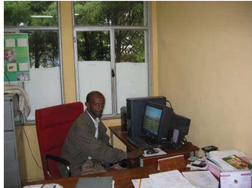
Finchaa's EDP Manager

Follow-up: development and implementation of the MIS daughter company Agromation