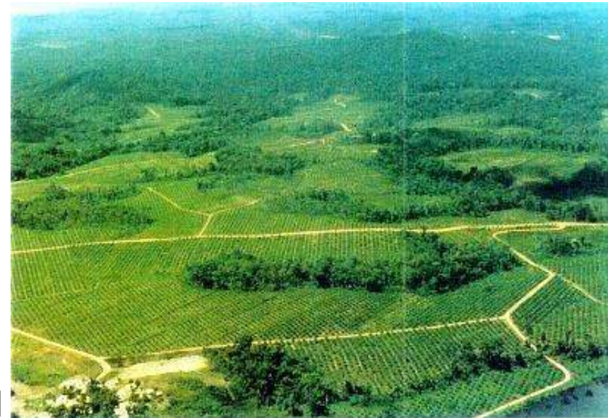
Oil palm established in selectively cleared forest