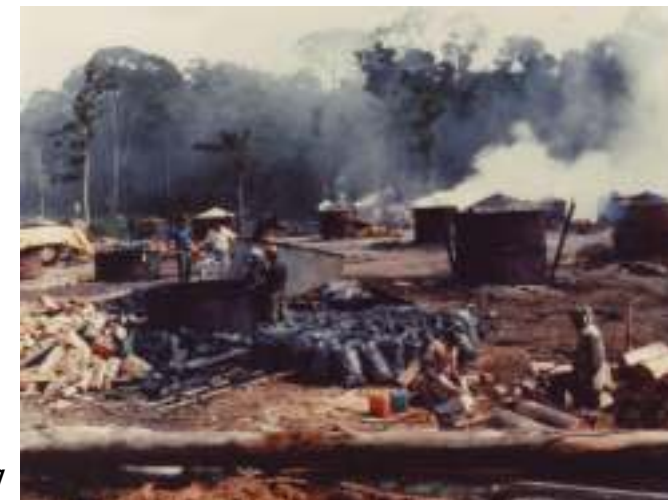
Charcoal production integrated with forest clearing