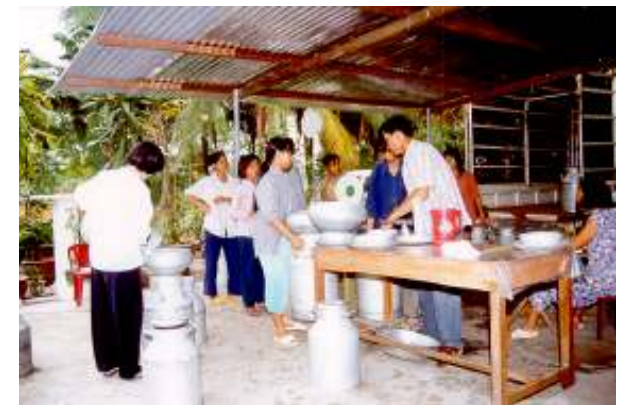
Milk collection point