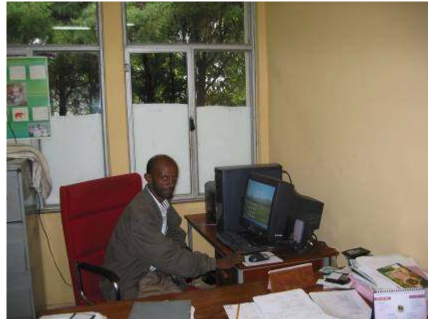
Finchaa's EDP Manager

Follow-up: development and implementation of the MIS daughter company Agromation